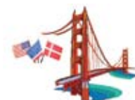
Rebild National Park Society, Inc San Francisco Chapter