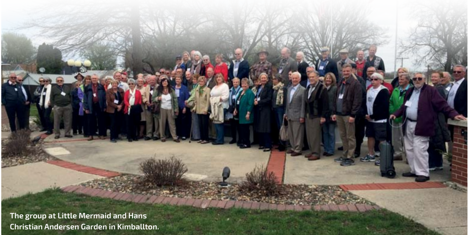
The group at Little Mermaid and Hans Christian Andersen Garden in Kimballton.